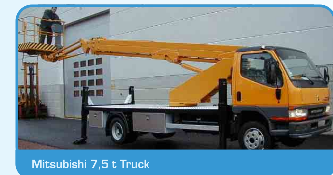
Mitsubishi 7,5 t Truck

XS 240 boom construction can be easily fitted to other applications