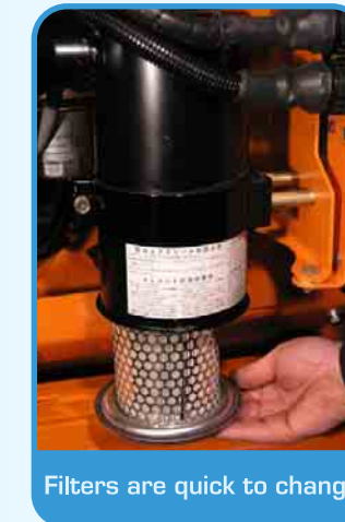
Filters are quick to change.