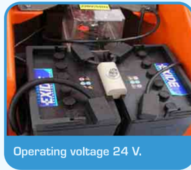
Operating voltage 24 V.