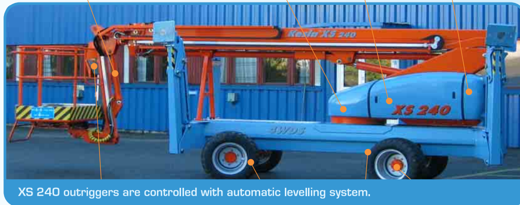
XS 240 outriggers are controlled with automatic levelling system.