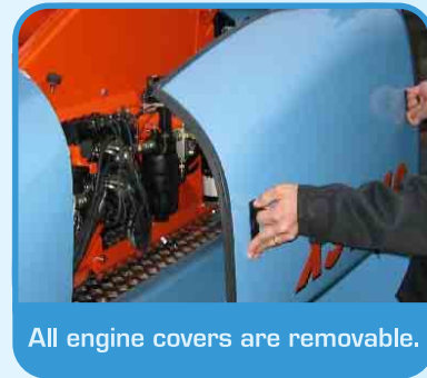
All engine covers are removable.