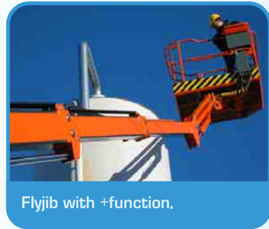
Flyjib with +function.