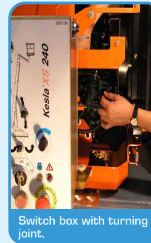
Switch box with turning joint.