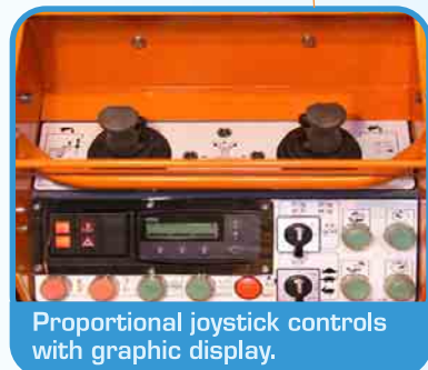
Proportional joystick controls with graphic display.