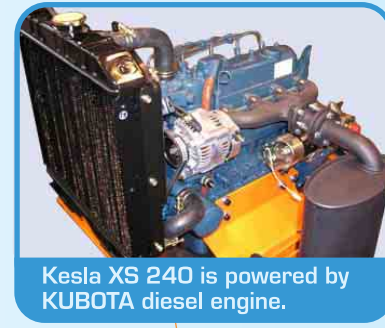
Kesla XS 240 is powered by KUBOTA diesel engine.