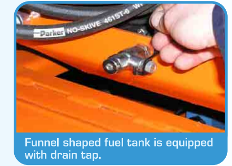
Funnel shaped fuel tank is equipped with drain tap.