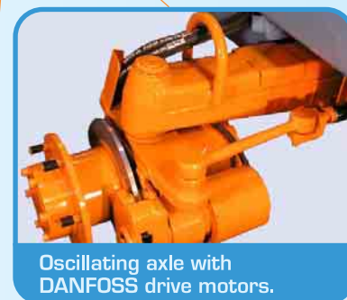
Oscillating axle with DANFOSS drive motors.