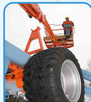
All terrain 4WD, gradeability 20° / 35%.