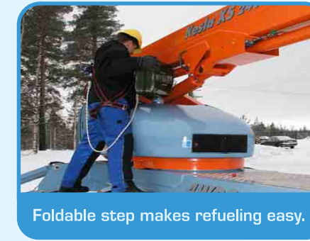
Foldable step makes refueling easy.